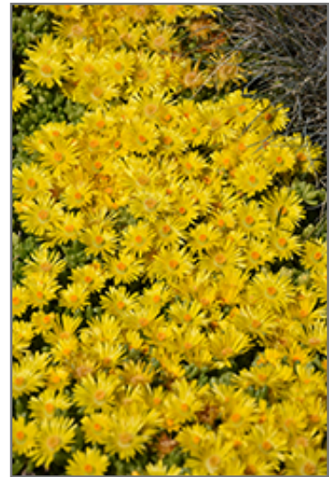
Yellow Ice Plant flowers

Yellow Ice Plant is recommended for the following landscape applications;