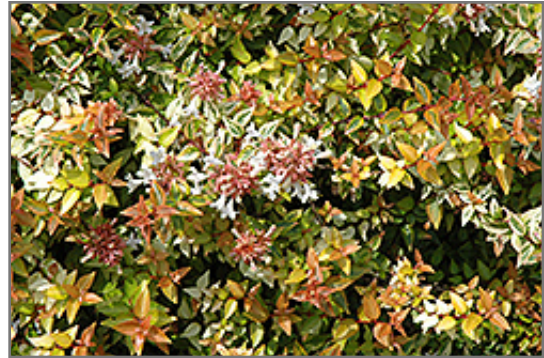
Kaleidoscope Abelia flowers

This shrub will require occasional maintenance and upkeep, and should only be pruned after flowering to avoid removing any of the current season's flowers. It is a good choice for attracting birds, bees and butterflies to your yard, but is not particularly attractive to deer who tend to leave it alone in favor of tastier treats. It has no significant negative characteristics.