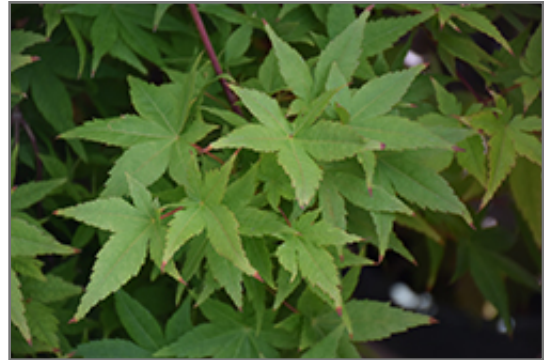
Ryusen Japanese Maple foliage