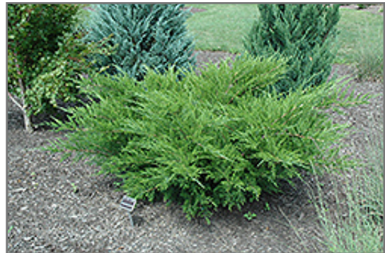
Sea Green Juniper

Sea Green Juniper is recommended for the following landscape applications;