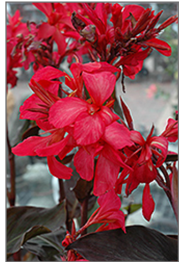
Australia Canna flowers

This plant should only be grown in full sunlight. It requires an evenly moist well-drained soil for optimal growth, but will die in standing water. It is not particular as to soil pH, but grows best in rich soils. It is highly tolerant of urban pollution and will even thrive in inner city environments, and will benefit from being planted in a relatively sheltered location. Consider applying a thick mulch around the root zone in winter to protect it in exposed locations or colder microclimates. This particular variety is an interspecific hybrid. It can be propagated by division; however, as a cultivated variety, be aware that it may be subject to certain restrictions or prohibitions on propagation.