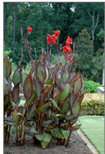
Australia Canna in bloom