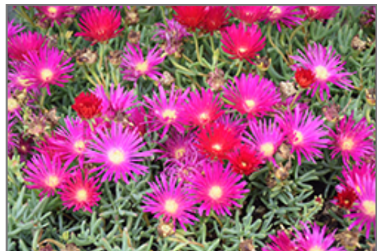
Purple Ice Plant flowers