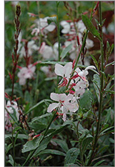
Ballerina Blush Gaura flowers

This is a relatively low maintenance plant, and is best cleaned up in early spring before it resumes active growth for the season. It is a good choice for attracting butterflies to your yard, but is not particularly attractive to deer who tend to leave it alone in favor of tastier treats. It has no significant negative characteristics.