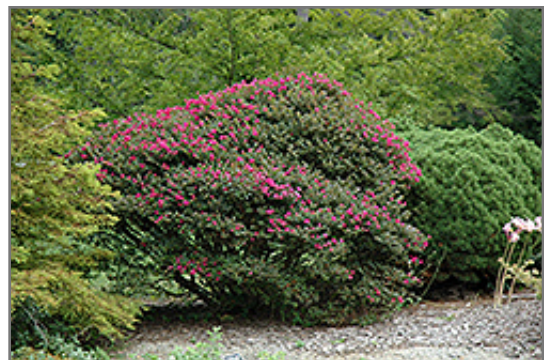
Pocomoke Crapemyrtle in bloom