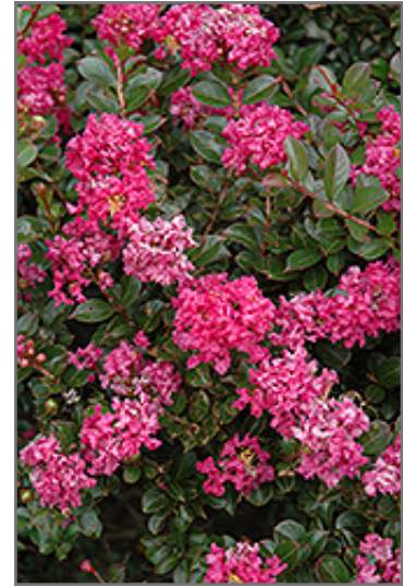
Pocomoke Crapemyrtle flowers

Pocomoke Crapemyrtle is recommended for the following landscape applications;