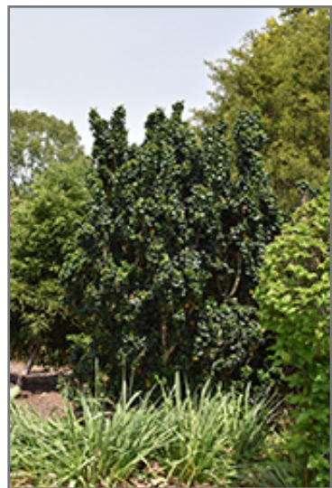
Dwarf Japanese Privet