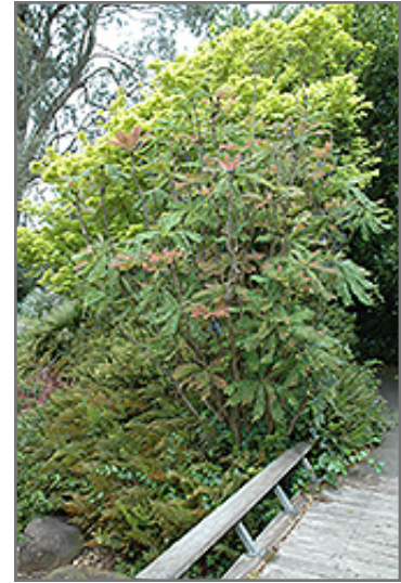
Chinese Mahonia

This shrub does best in partial shade to shade. It does best in average to evenly moist conditions, but will not tolerate standing water. It is not particular as to soil pH, but grows best in rich soils. It is somewhat tolerant of urban pollution, and will benefit from being planted in a relatively sheltered location. Consider applying a thick mulch around the root zone in winter to protect it in exposed locations or colder microclimates. This species is not originally from North America.