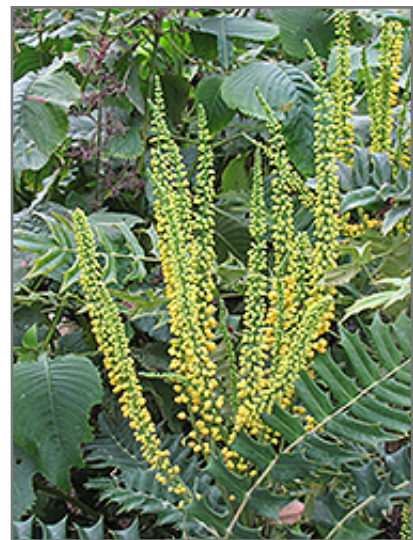
Chinese Mahonia flowers