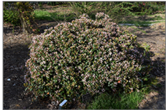
Eleanor Taber Indian Hawthorn in bloom

Eleanor Taber Indian Hawthorn is recommended for the following landscape applications;