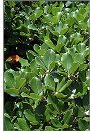
Eleanor Taber Indian Hawthorn foliage

This shrub does best in full sun to partial shade. It prefers to grow in average to moist conditions, and shouldn't be allowed to dry out. It is not particular as to soil type or pH. It is somewhat tolerant of urban pollution. This is a selected variety of a species not originally from North America.