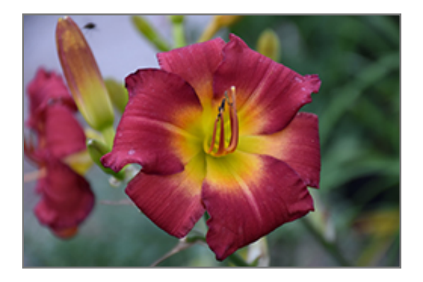
Earlybird Cardinal Daylily flowers