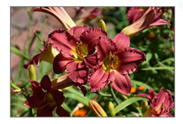
Earlybird Cardinal Daylily flowers