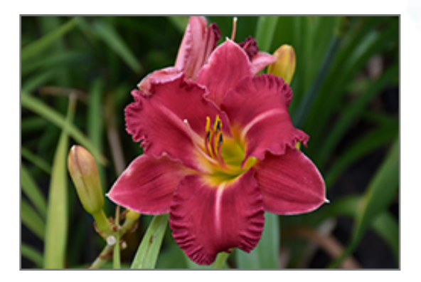
Earlybird Cardinal Daylily flowers

This plant does best in full sun to partial shade. It is very adaptable to both dry and moist locations, and should do just fine under typical garden conditions. It is not particular as to soil type or pH. It is highly tolerant of urban pollution and will even thrive in inner city environments. This particular variety is an interspecific hybrid. It can be propagated by division; however, as a cultivated variety, be aware that it may be subject to certain restrictions or prohibitions on propagation.