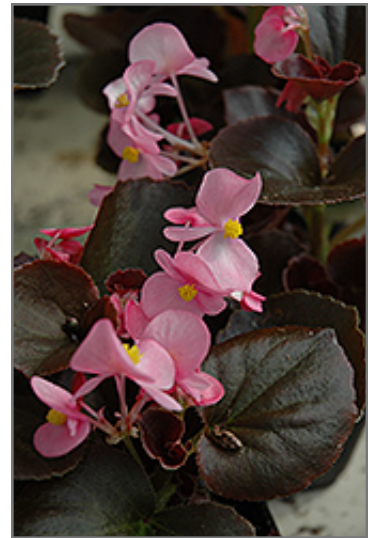
Cocktail Gin Begonia flowers