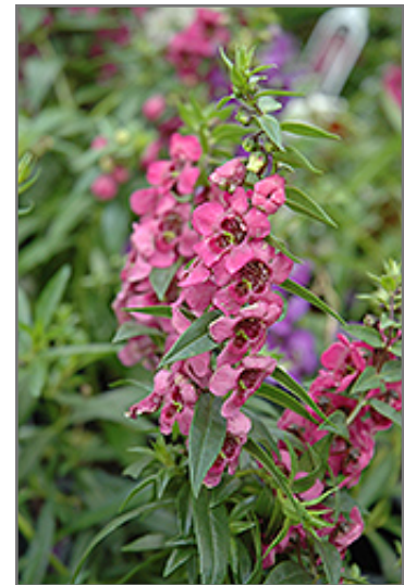
Pink Angelonia flowers