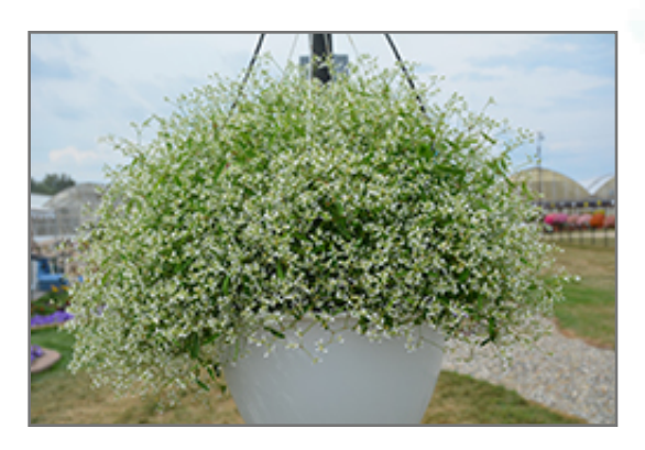
Diamond Frost Euphorbia in bloom

This plant does best in full sun to partial shade. It prefers dry to average moisture levels with very well-drained soil, and will often die in standing water. It is considered to be drought-tolerant, and thus makes an ideal choice for a low-water garden or xeriscape application. It is not particular as to soil type or pH. It is highly tolerant of urban pollution and will even thrive in inner city environments. This particular variety is an interspecific hybrid, and parts of it are known to be toxic to humans and animals, so care should be exercised in planting it around children and pets. It can be propagated by cuttings; however, as a cultivated variety, be aware that it may be subject to certain restrictions or prohibitions on propagation.