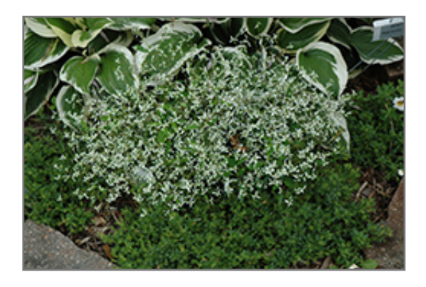
Diamond Frost Euphorbia in bloom