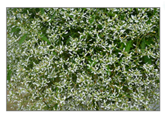
Diamond Frost Euphorbia flowers