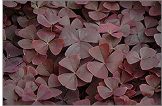
Charmed Velvet Shamrock foliage