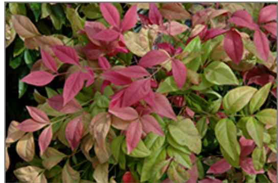
Blush Pink Nandina foliage

Blush Pink Nandina is recommended for the following landscape applications;