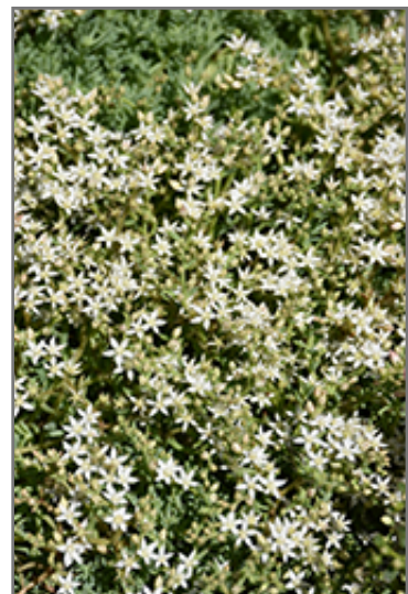
Dwarf Spanish Stonecrop flowers