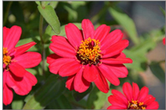
Profusion Double Hot Cherry Zinnia flowers

Profusion Double Hot Cherry Zinnia is recommended for the following landscape applications;