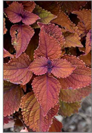
Wall Street Coleus foliage