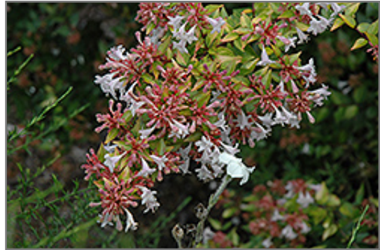
Francis Mason Abelia flowers

Francis Mason Abelia is recommended for the following landscape applications;