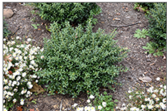
Soft Touch Japanese Holly