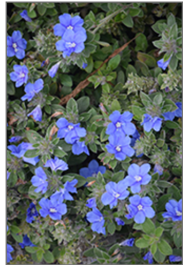
Blue My Mind Morning Glory flowers

Blue My Mind Morning Glory is recommended for the following landscape applications;