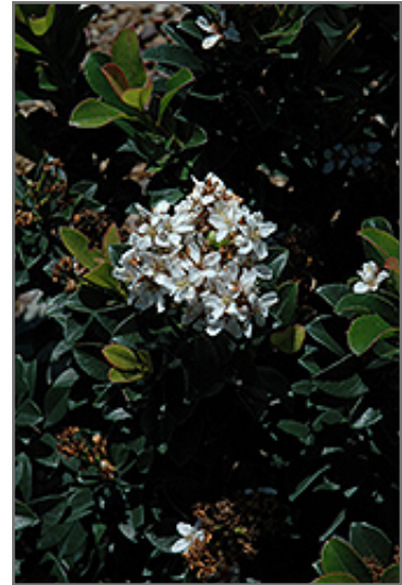
Snow White Indian Hawthorn flowers