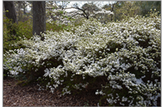
Snow Azalea in bloom

Snow Azalea is recommended for the following landscape applications;