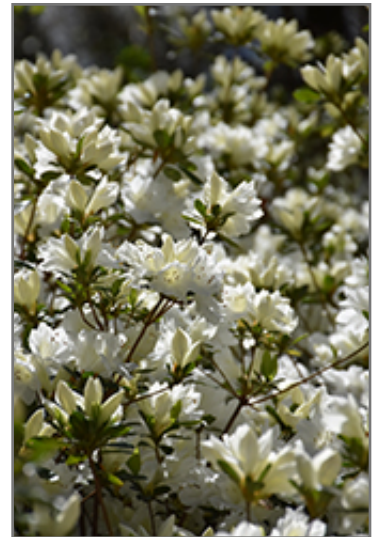
Snow Azalea flowers