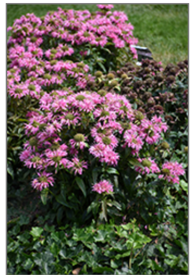
Pardon My Pink Beebalm in bloom