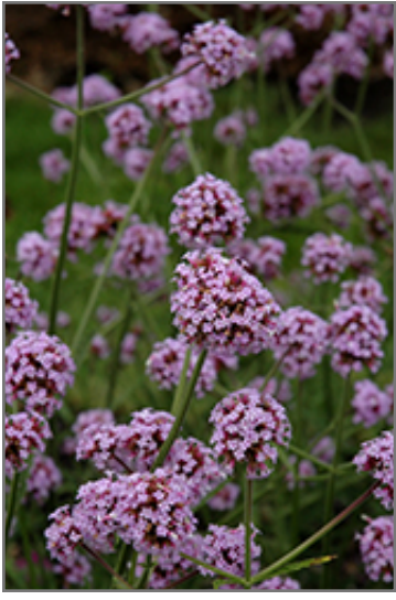
Meteor Shower Verbena flowers

An airy, tall variety with a long bloom period; pinkish-purple buds that open to lilac flowers, that will eventually mature to nearly white; a great plant for borders or containers