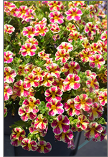
Superbells Holy Moly! Calibrachoa flowers

This plant will require occasional maintenance and upkeep. Trim off the flower heads after they fade and die to encourage more blooms late into the season. It is a good choice for attracting bees and hummingbirds to your yard, but is not particularly attractive to deer who tend to leave it alone in favor of tastier treats. It has no significant negative characteristics.