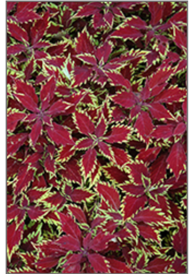
ColorBlaze Royale Apple Brandy Coleus foliage

ColorBlaze Royale Apple Brandy Coleus is recommended for the following landscape applications;