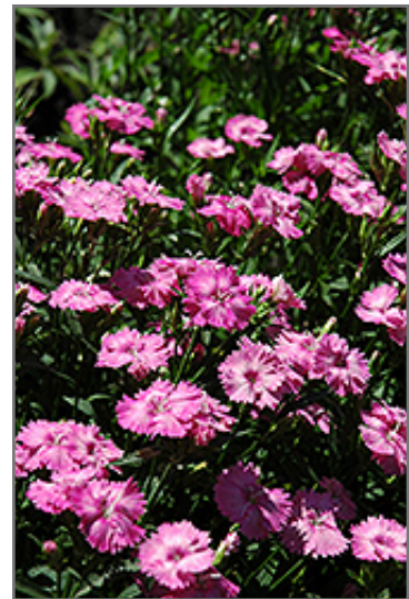
Blue Hills Pinks flowers