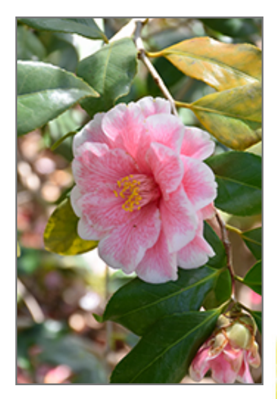
Lady Vansittart Camellia flowers