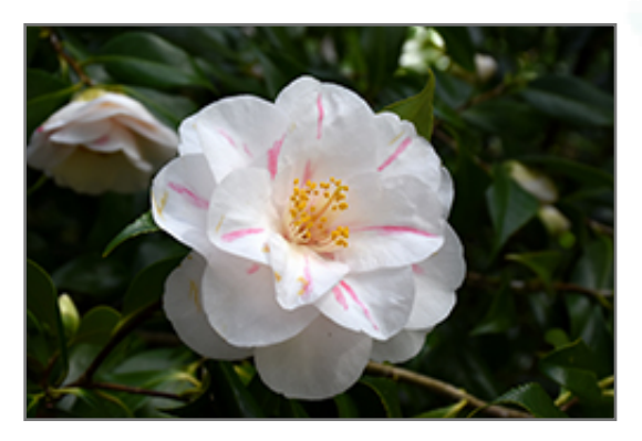
Lady Vansittart Camellia flowers

Lady Vansittart Camellia is recommended for the following landscape applications;