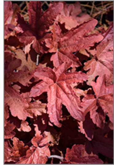
Fun and Games Red Rover Foamy Bells foliage

This is a relatively low maintenance plant, and should be cut back in late fall in preparation for winter. It is a good choice for attracting hummingbirds to your yard. It has no significant negative characteristics.