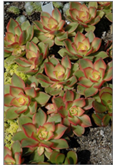
Kiwi Aeonium