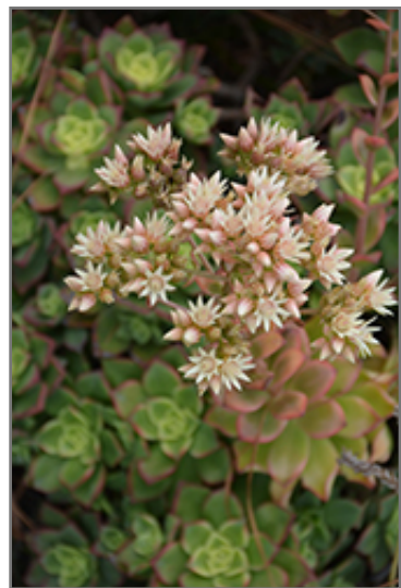
Kiwi Aeonium flowers