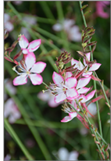
Rosy Jane Gaura flowers

Rosy Jane Gaura is recommended for the following landscape applications;