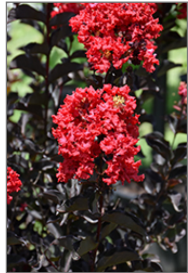
Ebony Fire Crapemyrtle flowers