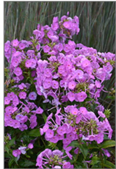
Fashionably Early Flamingo Garden Phlox flowers