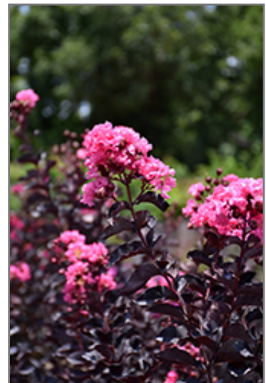
Black Diamond Shell Pink Crapemyrtle flowers