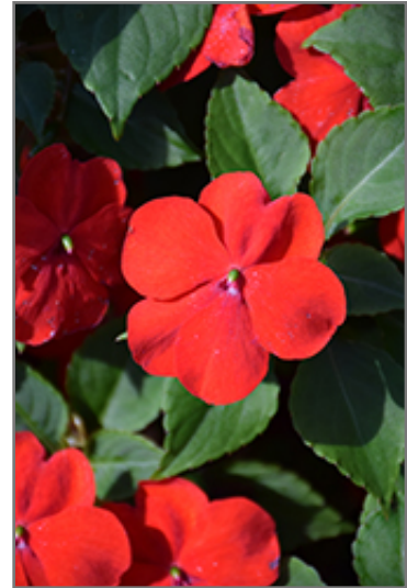
Beacon Bright Red Impatiens flowers

Beacon Bright Red Impatiens is recommended for the following landscape applications;