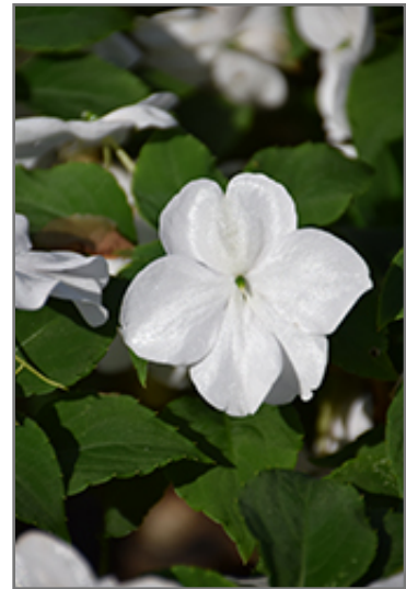
Beacon White Impatiens flowers

Beacon White Impatiens is recommended for the following landscape applications;