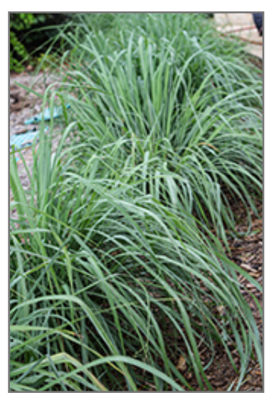
Lemon Grass

Aside from its primary use as an edible, Lemon Grass is sutiable for the following landscape applications;