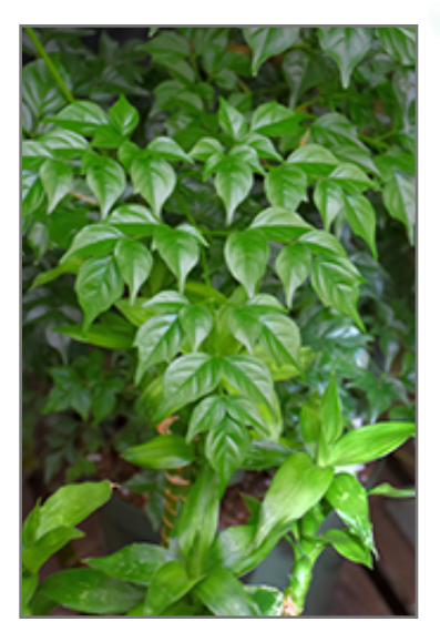
China Doll foliage

When grown indoors, China Doll can be expected to grow to be about 6 feet tall at maturity, with a spread of 4 feet. It grows at a medium rate, and under ideal conditions can be expected to live for approximately 40 years. This houseplant will do well in a location that gets either direct or indirect sunlight, although it will usually require a more brightly-lit environment than what artificial indoor lighting alone can provide. It does best in average to evenly moist soil, but will not tolerate standing water. The surface of the soil shouldn't be allowed to dry out completely, and so you should expect to water this plant once and possibly even twice each week. Be aware that your particular watering schedule may vary depending on its location in the room, the pot size, plant size and other conditions; if in doubt, ask one of our experts in the store for advice. It is not particular as to soil type or pH; an average potting soil should work just fine.