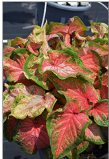
Heart to Heart Chinook Caladium foliage