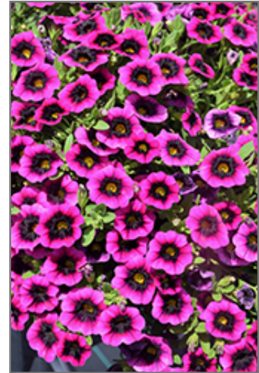
Superbells Blackcurrent Punch Calibrachoa flowers

This plant will require occasional maintenance and upkeep. Trim off the flower heads after they fade and die to encourage more blooms late into the season. It is a good choice for attracting bees and hummingbirds to your yard, but is not particularly attractive to deer who tend to leave it alone in favor of tastier treats. It has no significant negative characteristics.