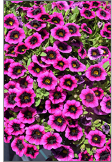
Superbells Blackcurrent Punch Calibrachoa flowers

This plant will require occasional maintenance and upkeep. Trim off the flower heads after they fade and die to encourage more blooms late into the season. It is a good choice for attracting bees and hummingbirds to your yard, but is not particularly attractive to deer who tend to leave it alone in favor of tastier treats. It has no significant negative characteristics.