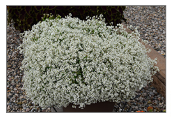
Diamond Snow Euphorbia in bloom

Diamond Snow Euphorbia is recommended for the following landscape applications;