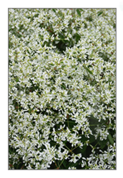
Diamond Snow Euphorbia flowers

This is a relatively low maintenance plant, and should not require much pruning, except when necessary, such as to remove dieback. Deer don't particularly care for this plant and will usually leave it alone in favor of tastier treats. It has no significant negative characteristics.