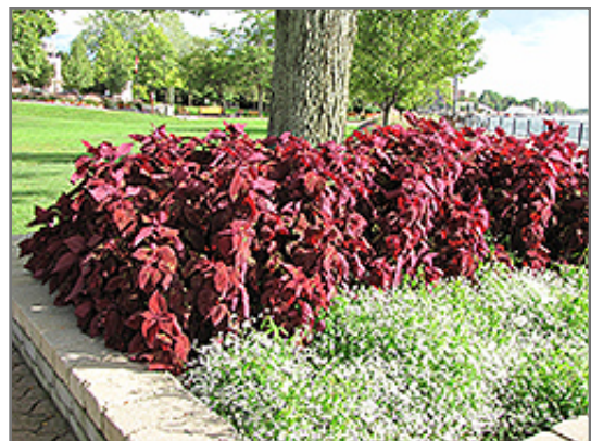
ColorBlaze Rediculous Coleus