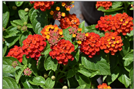
Hot Blooded Red Lantana flowers

This is a relatively low maintenance shrub, and should not require much pruning, except when necessary, such as to remove dieback. It is a good choice for attracting butterflies and hummingbirds to your yard, but is not particularly attractive to deer who tend to leave it alone in favor of tastier treats. It has no significant negative characteristics.