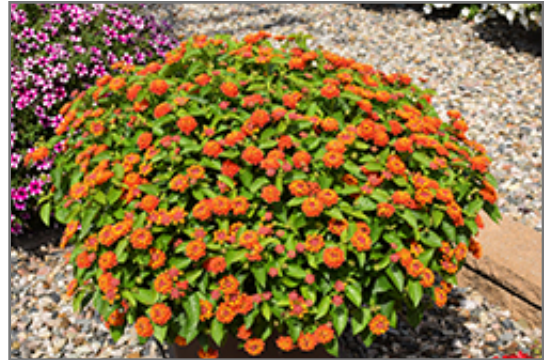
Hot Blooded Red Lantana in bloom

Hot Blooded Red Lantana will grow to be about 18 inches tall at maturity, with a spread of 28 inches. When grown in masses or used as a bedding plant, individual plants should be spaced approximately 12 inches apart. It has a low canopy. It grows at a fast rate, and under ideal conditions can be expected to live for approximately 20 years.