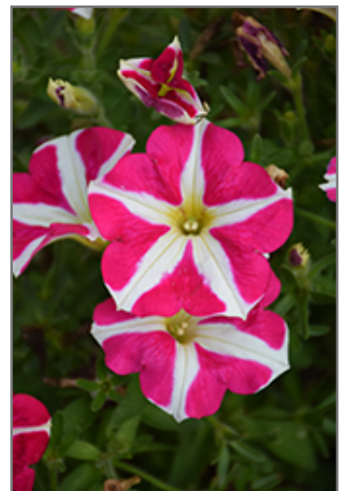
Amore Pink Heart Petunia flowers