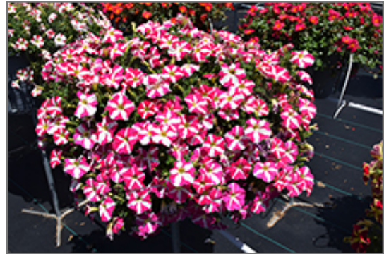
Amore Pink Heart Petunia in bloom

Amore Pink Heart Petunia will grow to be about 12 inches tall at maturity, with a spread of 14 inches. When grown in masses or used as a bedding plant, individual plants should be spaced approximately 10 inches apart. Its foliage tends to remain dense right to the ground, not requiring facer plants in front. This fast-growing annual will normally live for one full growing season, needing replacement the following year.