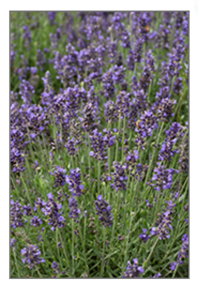
Blue Spear Lavender flowers

Blue Spear Lavender is recommended for the following landscape applications;