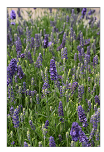
Blue Spear Lavender flowers