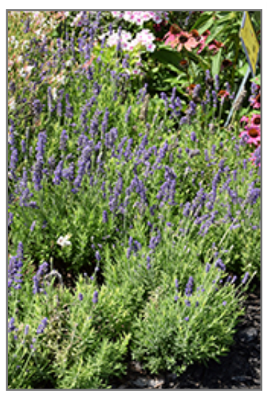
Blue Spear Lavender in bloom

This shrub should only be grown in full sunlight. It prefers dry to average moisture levels with very well-drained soil, and will often die in standing water. It is considered to be drought-tolerant, and thus makes an ideal choice for a low-water garden or xeriscape application. It is not particular as to soil type, but has a definite preference for alkaline soils, and is able to handle environmental salt. It is highly tolerant of urban pollution and will even thrive in inner city environments. This is a selected variety of a species not originally from North America.