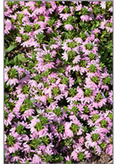
Surdiva Classic Pink Fan Flower flowers

Surdiva Classic Pink Fan Flower is recommended for the following landscape applications;