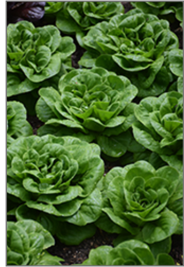
Buttercrunch Lettuce

Buttercrunch Lettuce will grow to be about 12 inches tall at maturity, with a spread of 6 inches. When planted in rows, individual plants should be spaced approximately 8 inches apart. This vegetable plant is an annual, which means that it will grow for one season in your garden and then die after producing a crop. Because of its relatively short time to maturity, it lends itself to a series of successive plantings each staggered by a week or two; this will prolong the effective harvest period.